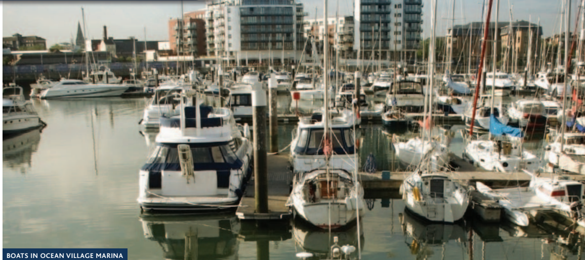
BOATS IN OCEAN VILLAGE MARINA